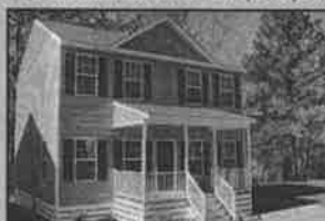
121 Westonia Rd. $229,900