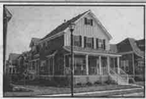
3204 Meanley Dr. $374,900