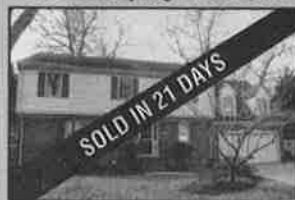
1525 Woodside Ct. $289,900