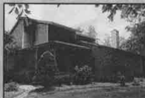
524 Woodards Ford Rd. $549,900