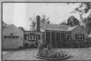
828 Jasmine Ave. $289,900