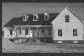
180 McPherson Rd. $299,900

Only 15 minutes from Grassfield Shopping Center off Route 17 VA Agents receive a 3% Referral Fee, call for details.