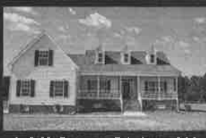
240 McPherson Rd. $289,900

CHESAPEAKE OFFICE 137 Mt. Pleasant Rd., Chesapeake, Va 23322