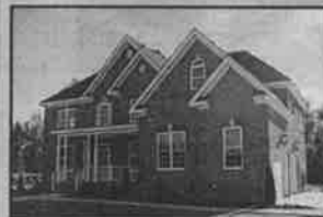
141 Green Spring Dr. $545,000

DIRECT LINE: (757) 410-7708 CELL: (757) 477-8577