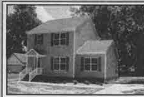
1209 Shell Rd. $204,900