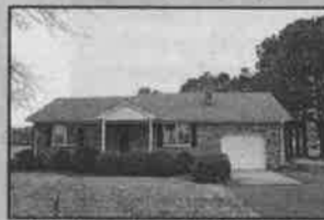
2944 Douglas Rd. $269,900